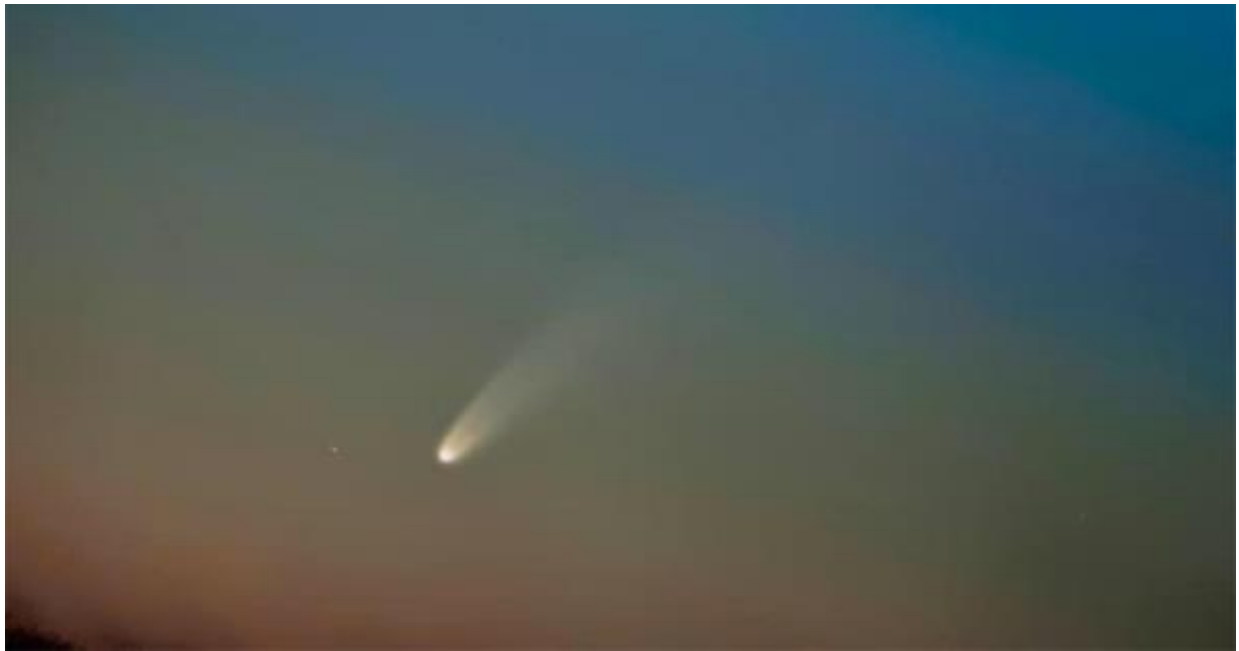
Photo was taken by Cosmonaut IvanVagner of comet Neowise from the International Space Station

One of the brightest comets in decades is passing Earth. Here's how to see it.