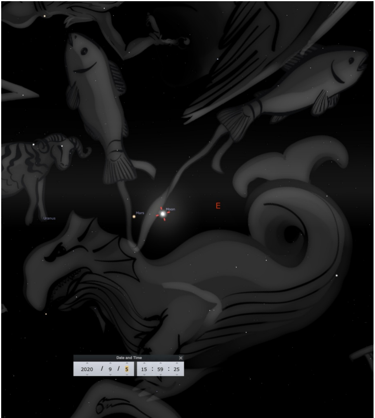
Aug 11 06:45 LAST QUARTER MOON